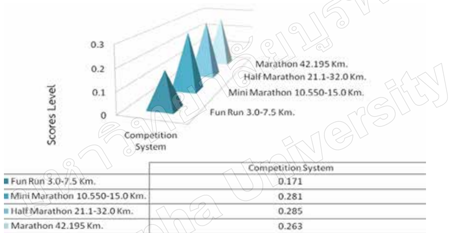
Figure 2: Ranking of marathon running systems

In consistent with application of analytical hierarchy process (AHP) and importance on factor, satisfaction of factor, and satisfaction index of organizing marathon running event at present, on the ground of satisfaction from the 3 stakeholders for quality of events, the analysis found that the best competition systems gave the highest importance on factor (7.512), satisfaction of factor (7.154), and satisfaction index (70.83%). These are marathon systems with a distance of 21.1-32.0 kilometer (0.285), 10.550-15.00 kilometer (0.281), 42.195 kilometer (0.263), and 5.00-7.5 kilometer (0.171) respectively. (figure 2 and 3)