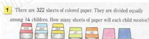
Figure 2: Problem situation for the students to find the solution

Additionally, the existence of the usage of relational thinking strategies for developing conceptual and procedural knowledge can be supported by the students' thinking in classroom observation on the problem situation on "The target task number 1" on the Four Phases of open approach as the teaching approach which is displayed in Figure 2.