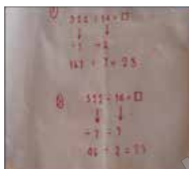
Figure 4: Students' Relational Thinking Strategies

The above figure shows that the students tried to use the idea of the rule of division as learnt before, but they misconceived about the selection of the divisor. The gaps between conceptual and procedural knowledge had occurred. When the students participated in the discussion, they had to compare their way of thinking with that of others and discuss their process finding with other students. In this sequential flow, relational thinking strategies in developing the relationship between conceptual and procedural knowledge occurred, as shown in Figure 4.